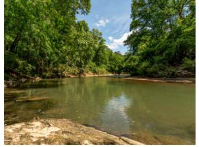
Jon Kohler & Associates www.JonKohler.com