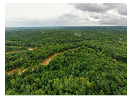
SVN Saunders Ralston Dantzler