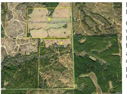
Pope Land Company popelandco.com