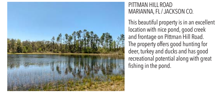
Allied Land & Timber Company, Inc. Alliedlandga.com