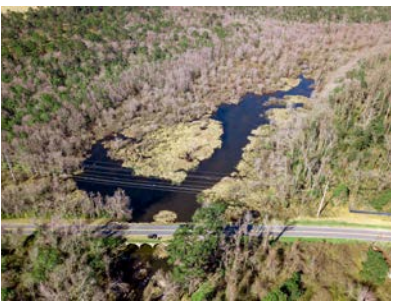
Southern Land Realty www.SouthernLandRealty.com