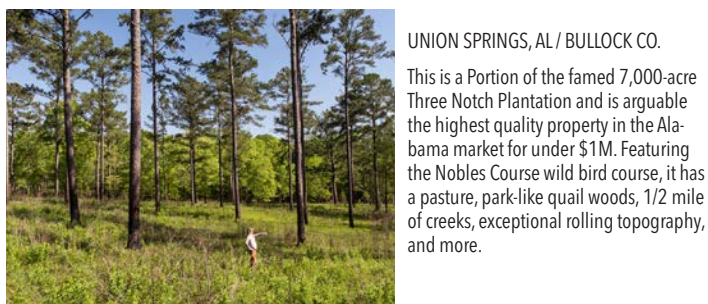
Jon Kohler & Associates www.JonKohler.com