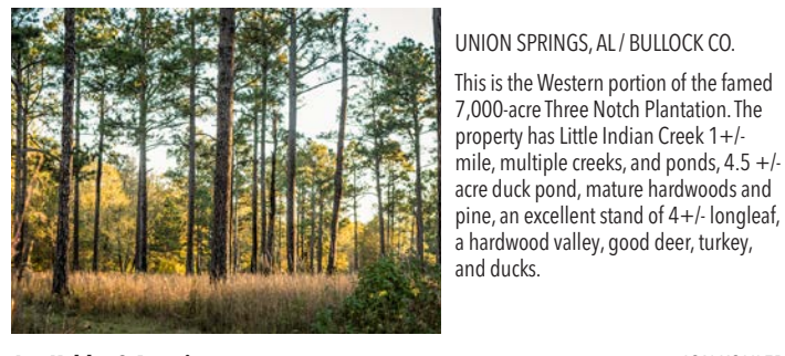
Jon Kohler & Associates www.lonKohler.com