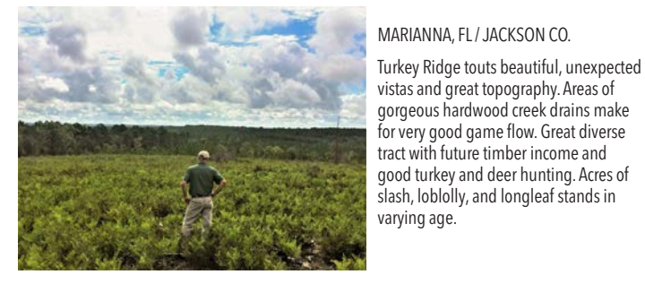
Jon Kohler & Associates www.JonKohler.com