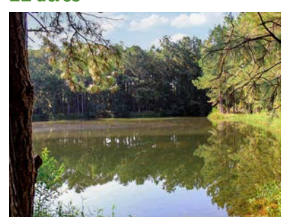
First Thomasville Realty www.thomasvillegarealestate.com