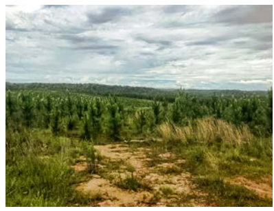
South Georgia Land and Timber www.landandtimber.net