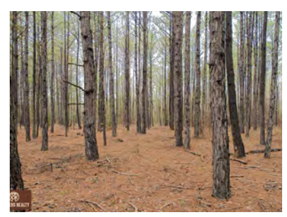
HWY 39 FORT GAINES, GA / CLAY COUNTY

The property has 147 acres of Prime-Statewide Important soils that could produce crops or be easily converted to high yield pecan/pine plantation. Natural pine/hardwood hills and 5 ponds that provide great fishing, duck hunting and water for wildlife.