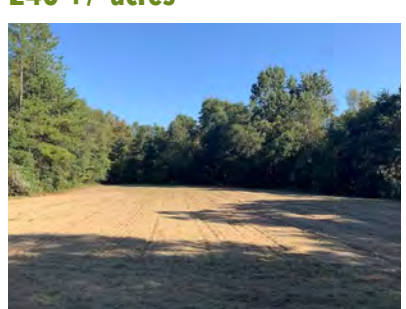
TARA ROAD MOULTRIE, GA / COLQUITT COUNTY

Mature pine and hardwood timber with long frontage along Ochlockonee River. The property has 2 ponds, approximately 31 acres in 2 cultivated fields, and located in an area known for enormous trophy bucks as well as a plentiful turkey population and good duck hunting. Excellent location.