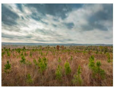
HWY 266 FORT GAINES, GA / CLAY COUNTY This contiguous acreage in a top timber

Inis contiguous acreage in a top timber and wildlife producing area of the state is a once-in-a-generation opportunity. Approximately 850 acres in young pine plantation means that for years and generations to come, the tract will provide income and wildlife habitat like no other.