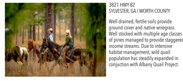
THE WRIGHT GROUP wrightbroker.com

of pines managed to provide staggered income streams. Due to intensive habitat management, wild quail population has steadily expanded in conjuction with Albany Quail Project.