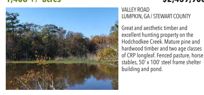
MATRE FORESTRY CONSULTING, INC.