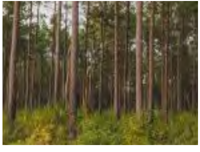
Keel Creek Plantation is a high quality recreational property located in the famed Albany Plantation Belt. Excellent deer, turkey and wild quail. 1.25 +/- miles on Keel Creek plus a 28+/- acre and 8+/- acre waterfowl ponds. Food plots, new fencing, good timber, red clay soils and more.