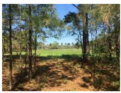
HARRELL MILL ROAD CLIMAX, GA / DECATUR COUNTY

This is fun tract to look at...bring your boots or a mule. A lot of mature loblolly, longleaf, and wiregrass. Lots of deer and turkey sign. Good looking hilltop overlooking beaver pond. Strong mix of hardwoods including white oaks. Lots of trails. Good looking private home sites. Farming area.