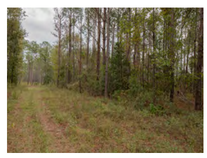
ΔΙ ΝΔΥ ΡΟΔΝ BAINBRIDGE, GA / DECATUR COUNTY

Wooded with mature pine and hardwood, level ground, little to no storm damage. Great building site with room for privacy and seclusion. 4 miles to Bainbridge High School, 4 miles to Bainbridge and 9 miles to Hwy 27S.