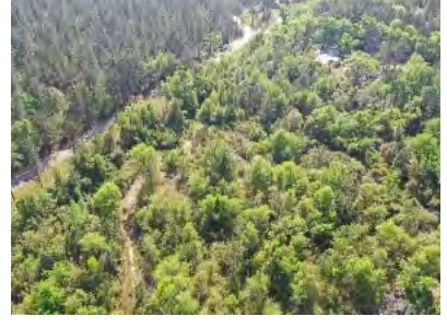
CROCKER REALTY, INC.