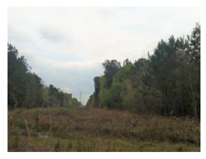
VETERANS PARKWAY SOUTH MOULTRIE, GA / COLQUITT COUNTY

An undeveloped tract along the Okapilco Creek in Moultrie with recreational activities possible.