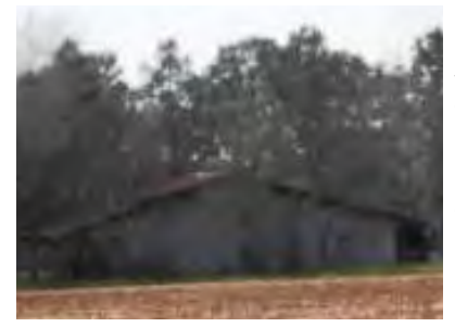
MILL POND ROAD COLEMAN, GA / CLAY COUNTY

This tract contains an ideal mix of open farmland and woodlands. Farm rental income potential with a good size, wooden barn, which could also serve as a hunt camp. Utilities are available and the hunting is excellent.