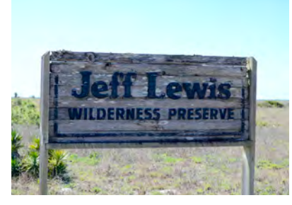
SVN SAUNDERS REAL ESTATE