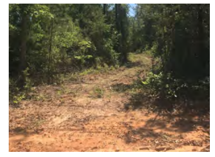
LAKE DOUGLAS ROAD BAINBRIDGE, GA / DECATUR COUNTY

This is a great tract of land that is priced to sell! This tract, located on Whittaker Road, would be a perfect homesite, hunting retreat, development for homes or cleared for farmland. For more details or to schedule a tour, contact Gina today!