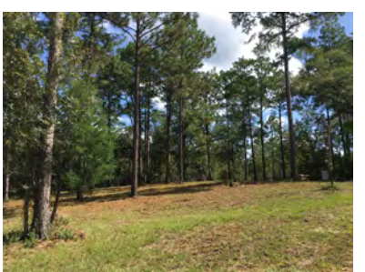
BAINBRIDGE, GA / DECATUR COUNTY

Located south of Bainbridge, this tract has lots of pines and some hardwood. Loaded with deer and turkey. Hunting, fishing, trail riding and a short drive to Bainbridge Country Club. Just over a mile to a public boat ramp. Beautiful combination of woods, cleared areas, trails and more.