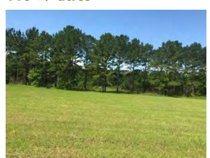
BETTSTOWN ROAD FACEVILLE, GA / DECATUR COUNTY

This is the perfect weekend retreat for the family to escape and enjoy the outdoors. Cabin home and a modern metal barn. Year round flowing creek. Excellent hunting tract.