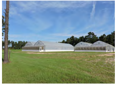
3103 THOMASVILLE ROAD BAINBRIDGE, GA / DECATUR COUNTY

This farm was certified organic and specialized in cucumbers, vegetable sales and retail farmer's market. Includes 2 (60x90) automated hydroponic computerized greenhouses(2014) along with irrigated 3-acre field and Tyson Steel building with walk-in cooler. This farm is first-rate and ready to grow!